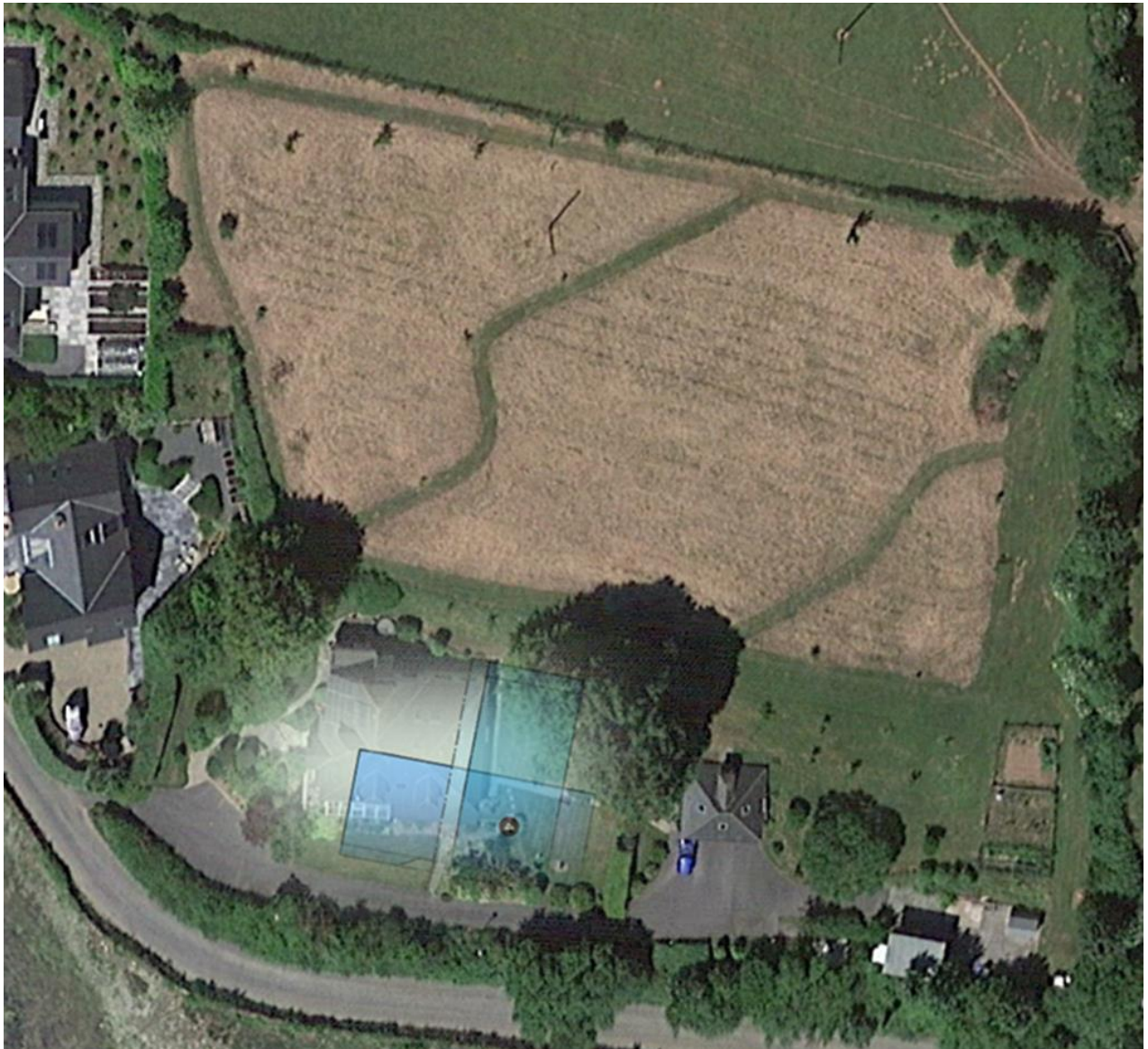
Image 6 perfectly illustrates why the mature pine trees had to be felled, to clear the way for the planned development.

So what built form can we expect to see at this highly visible location in future?