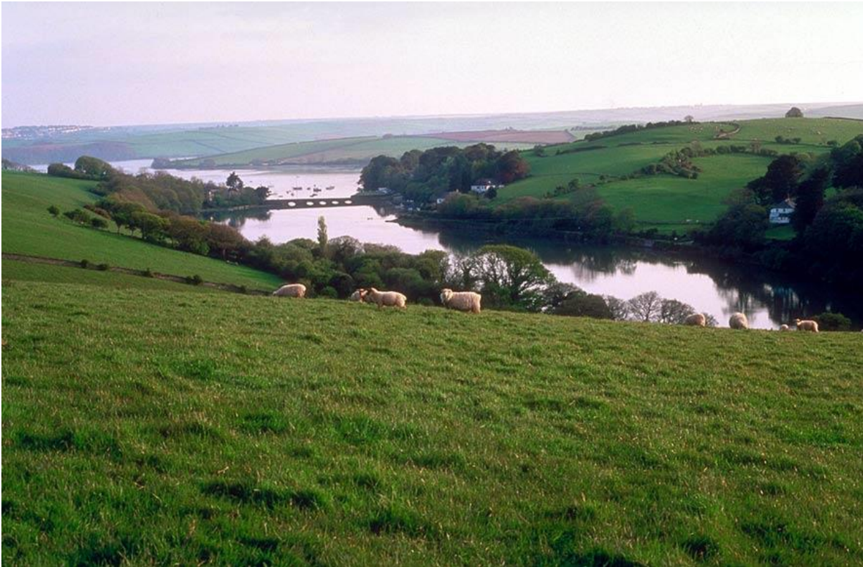
Image 11: Today, after unsympathetic development and tree fellings