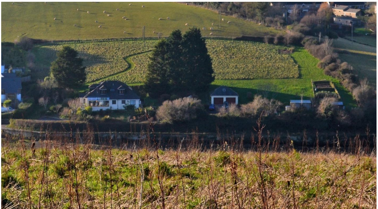
Image 3: The Appleford site in 2018. Numerous trees form part of the landscape