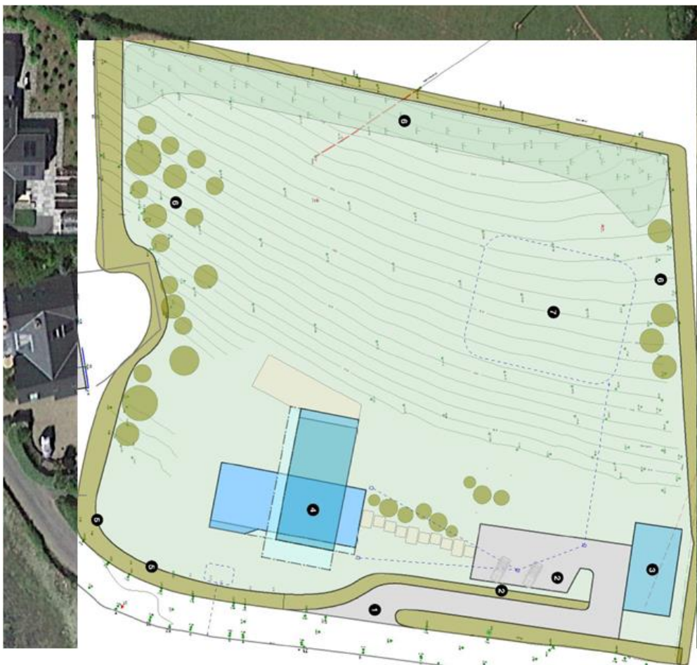
Image 6: The new building (in overlay) in relation to the current dwelling

Here we see that the footprint is significantly different. The new building will be set forward , nearer to the road and the SSSI, and over to the right - where the mature trees used to be.