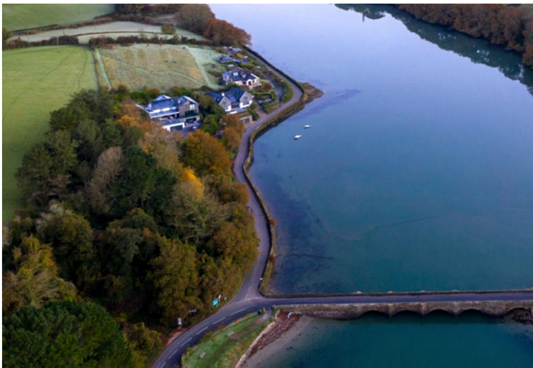
Image 1: Taken in 2020. Note the wooded area alongside the road junction.

In the decision to a previous planning application for Woodspring (ref. 28/1922/10/F) it was made clear that a wooded area was to be retained.